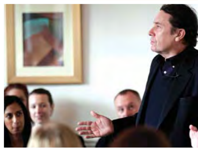
Jools Holland at the PTI Music Residential, 2012

We gave experienced teachers the time, the space and the inspirational backdrop to reflect on the value of Art and Music in school. We took them away from the classroom and allowed them to perform, to draw, and to embrace the challenge of passing on their passion to the next generation.